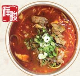
Yukgaejang Galbi Tang